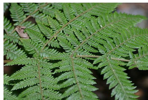
Photo 3 Lastreopsis silvestris , upper frond surface.

Adiantum silvaticum , Asplenium australasicum , Asplenium polyodon , Blechnum cartilagineum , Blechnum watsii , Calochlaena dubia , Cyathea australis , Cyathea leichhardtiana , Davallia pyxidata , Dictymia brownii , Gleichenia dicarpa , Gleichenia rupestris , Grammitis stenophylla , Hymenophyllum cupressiforme , Hypolepis muelleri , Lindsaea linearis , Lindsaea microphylla , Microsorium scandens , Platycterium bifurcatum , Platycterium superbum , Psilotum nudum , Pteridium esculentum , Pteris vittata , Pyrrosia rupestris , Sticherus lobatus .