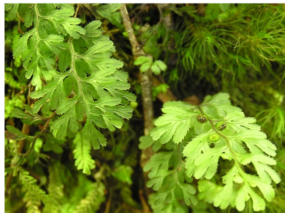
Photo 1. Hymenophyllum cupressiforme .

The lookout is one of the highest areas on Springbrook and is on the cliff edge overlooking the Tweed valley in New South Wales. The view is spectacular when the valley is not filled with clouds. Sunday was fine but the view was very hazy. Beside the lookout were many plants of Lastreopsis silvestris , a fern of high altitude and limited distribution.